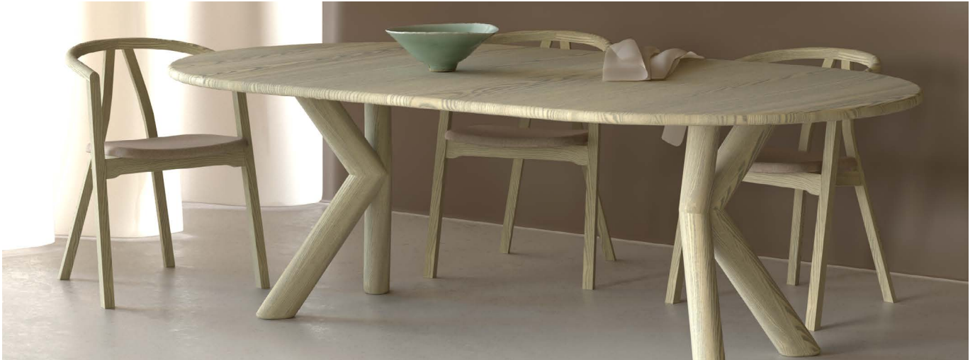
MUHLE dining table with two leaves and edge profile 8 - round.