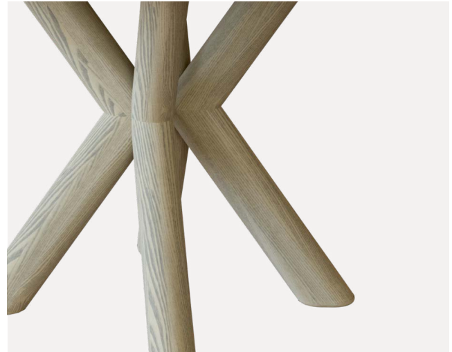
MUHLE dining table with edge profile 3 - Pisa (rounded).