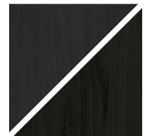
ASH C44 / OAK C44 Black matt lacquered

We treated this wood with our 'Grey brown oil'.