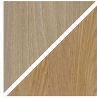
ASH C4 / OAK C4 Natural oiled

C3 are only made for products without patination.