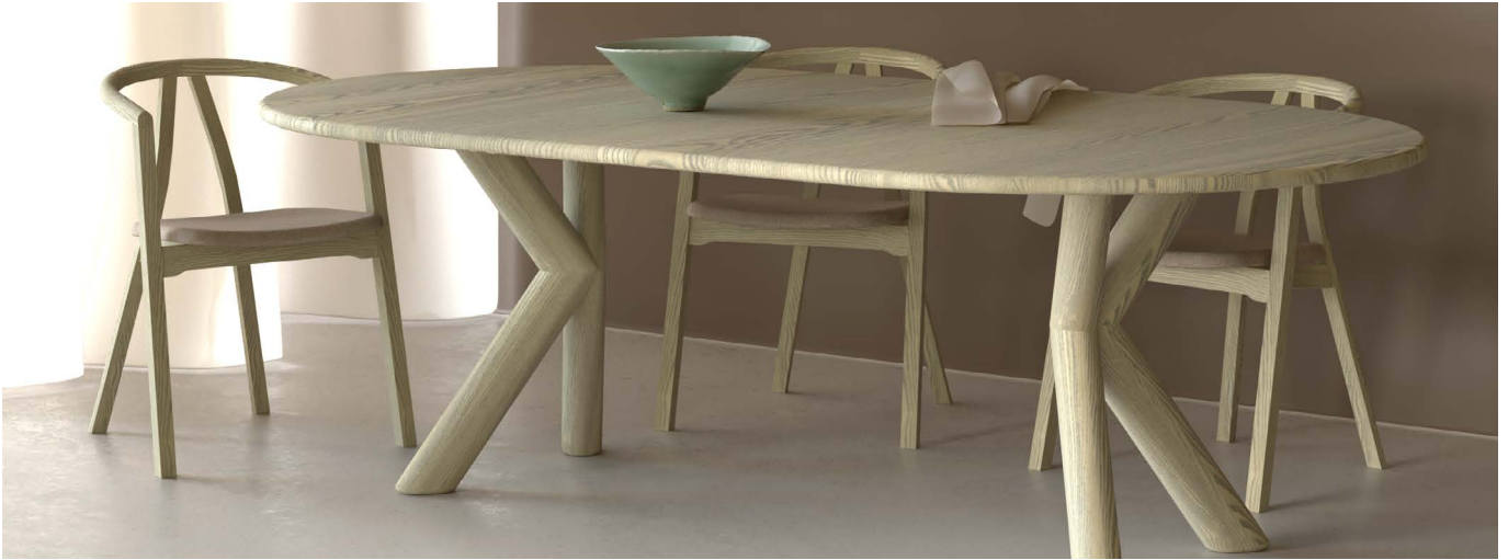
MUHLE dining table with two leaves and edge profile 8 - round.